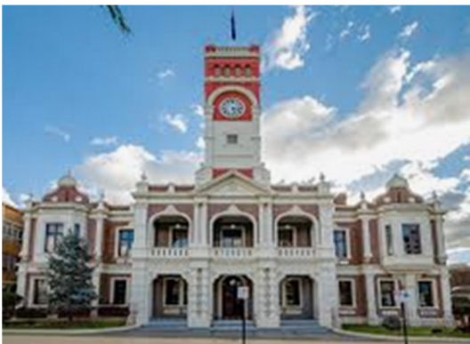
TOOWOOMBA TOWN CENTRE