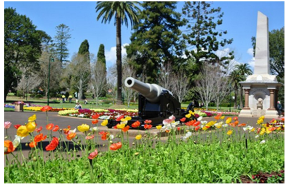
QUEENS PARK AND BOTANIC GARDENS