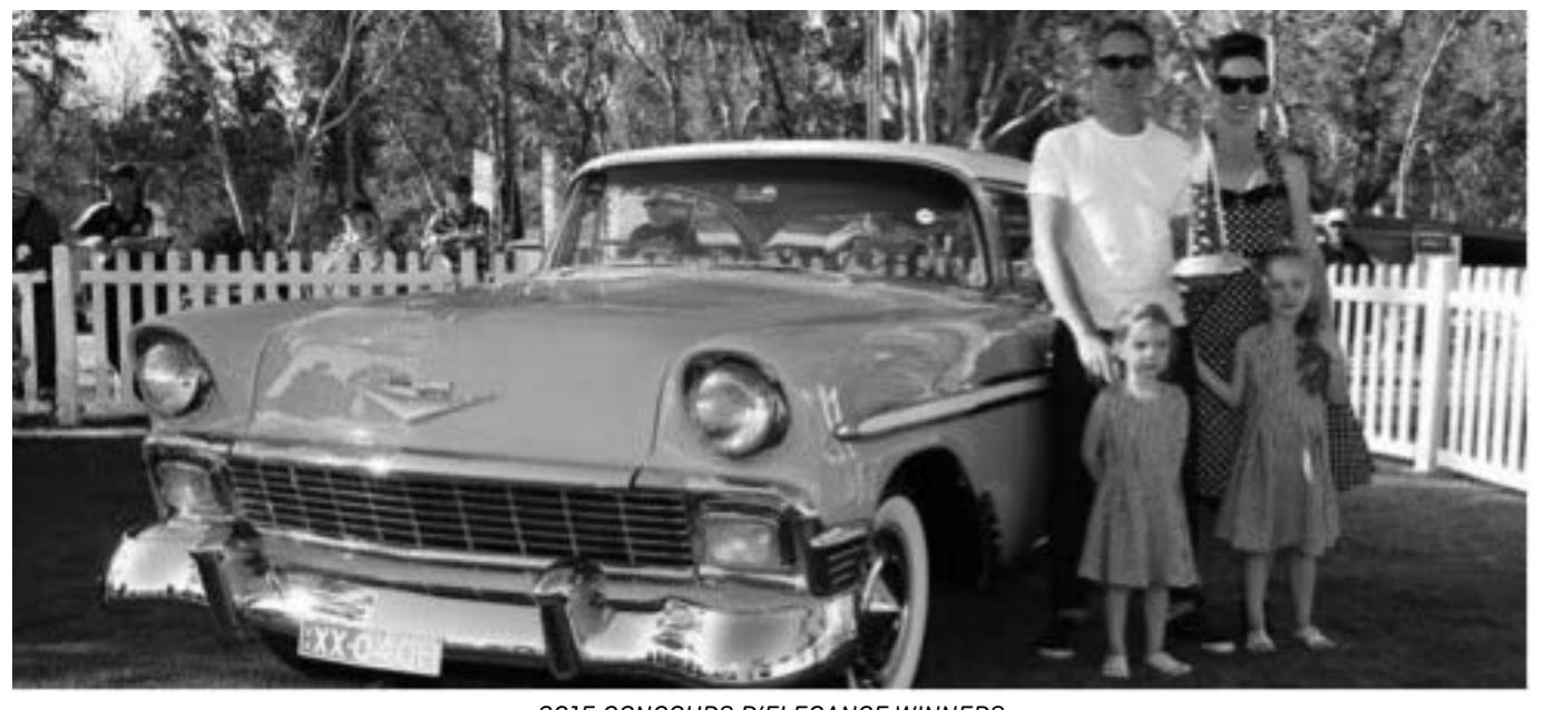
2015 CONCOURS D'ELEGANCE WINNERS