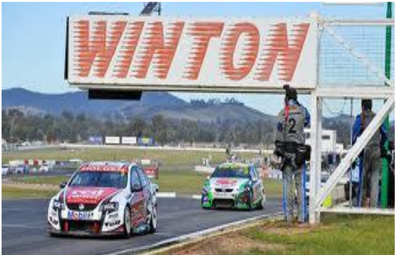
Winton Race Track