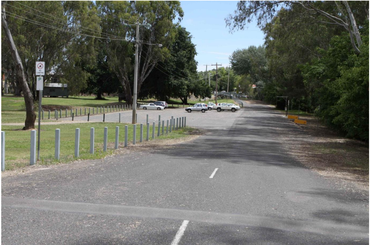
Apex Park Motorkhana Venue