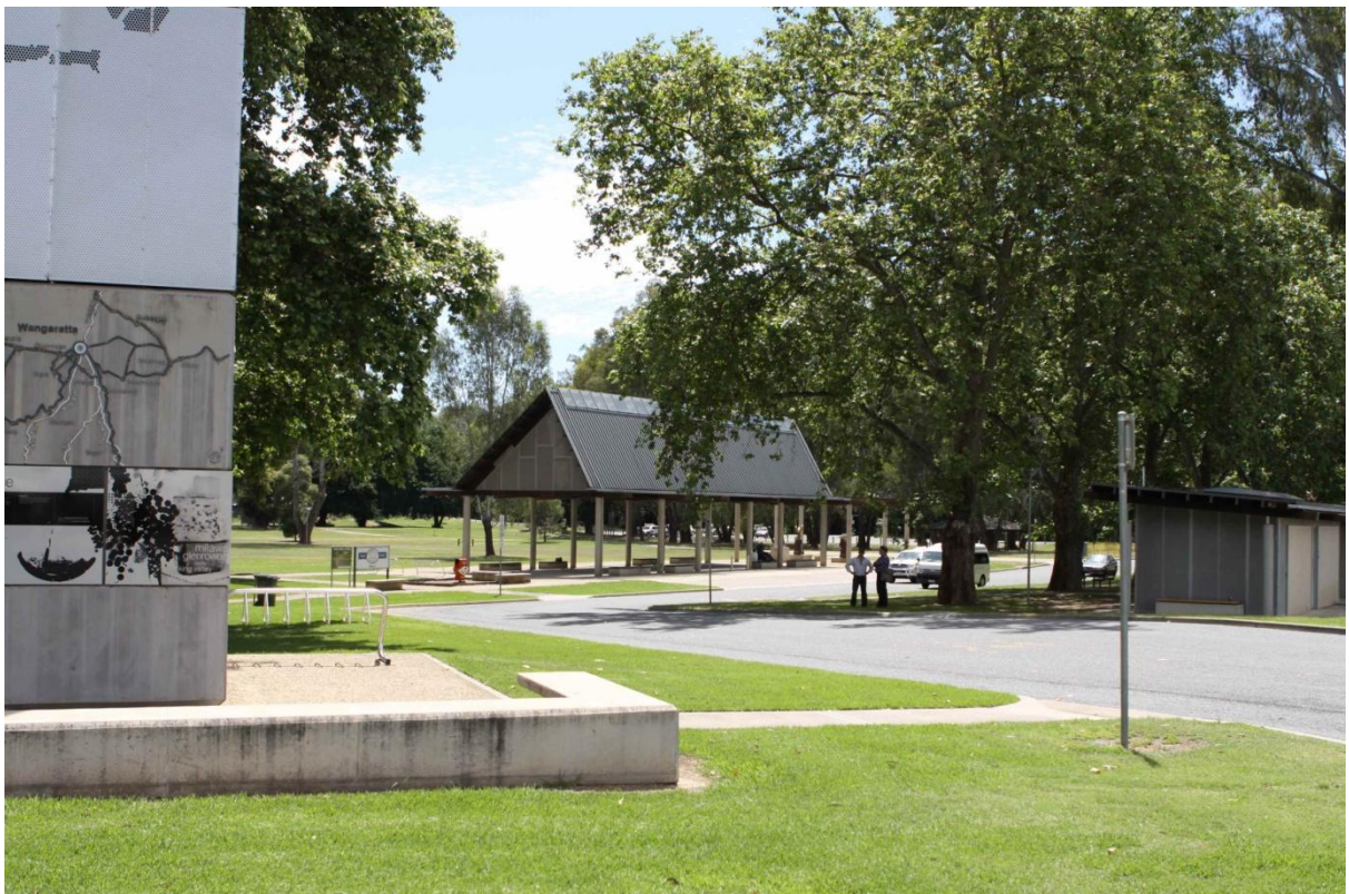
Apex Park Concourse Venue