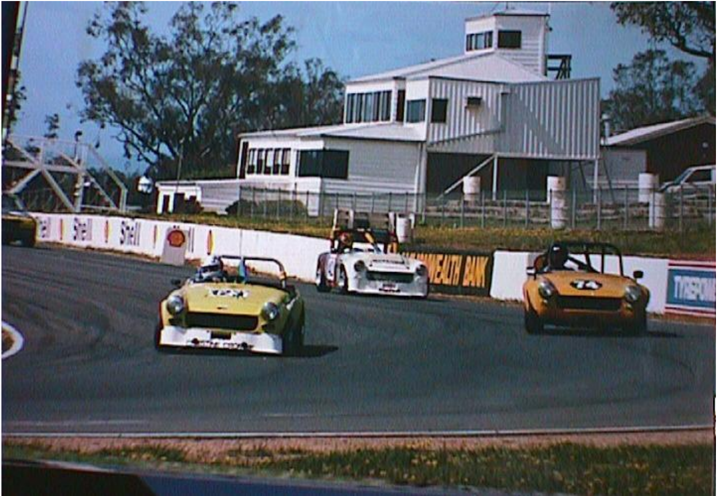
Sprites at Winton

For all enquires or details please contact Terri or Greg Corbin, AHSDC tmcorbin@bigpond.com Mobile: 0414 988 641 or gcorbin@bigpond.net.au Mobile: 0418 179 327