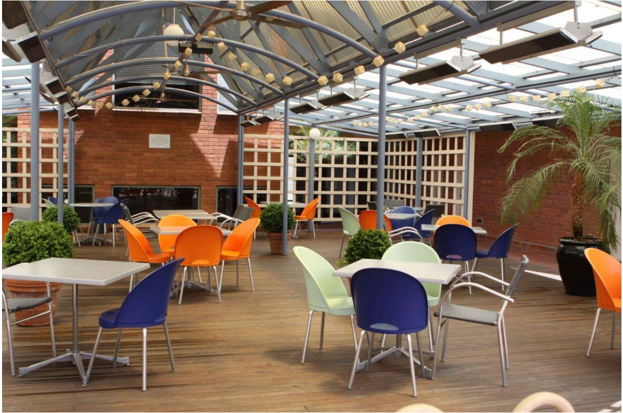
Wednesday night 'Meet and Greet' Venue